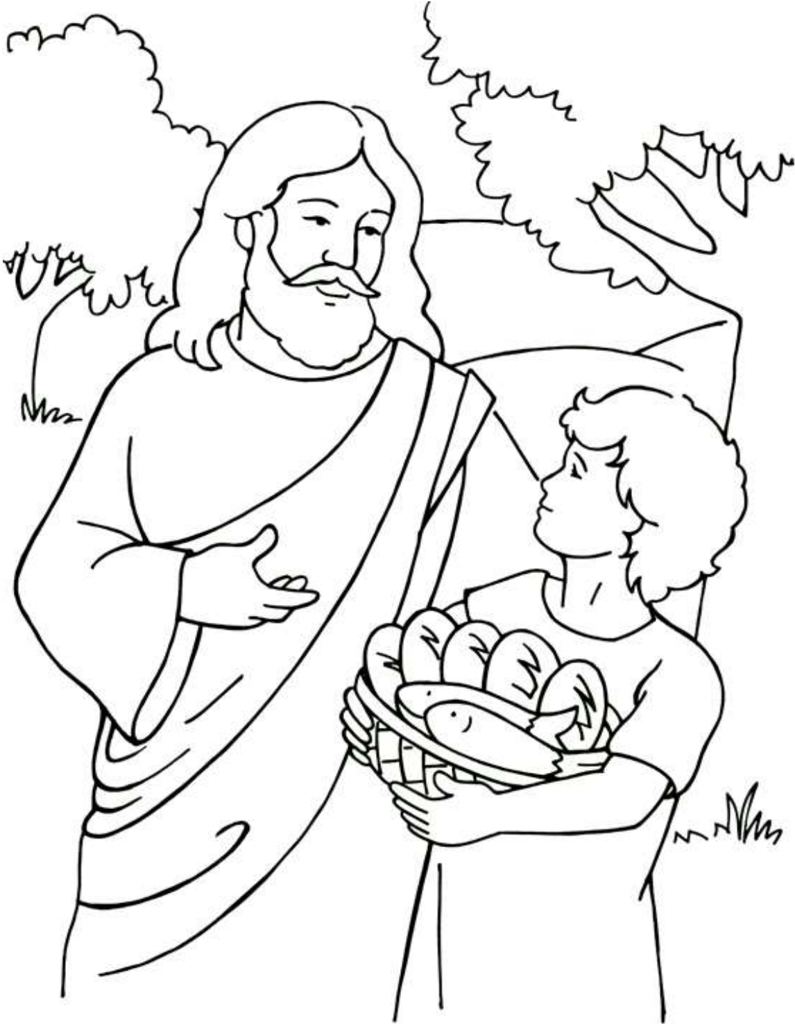
Jesus Feeds 5,000

From Thru-the-Bible Coloring Pages for Ages 4-8. © 1986,1988 Standard Publishing. Used by permission. Reproducible Coloring Books may be purchased from Standard Publishing, www.standardpub.com , 1-800-323-7543.