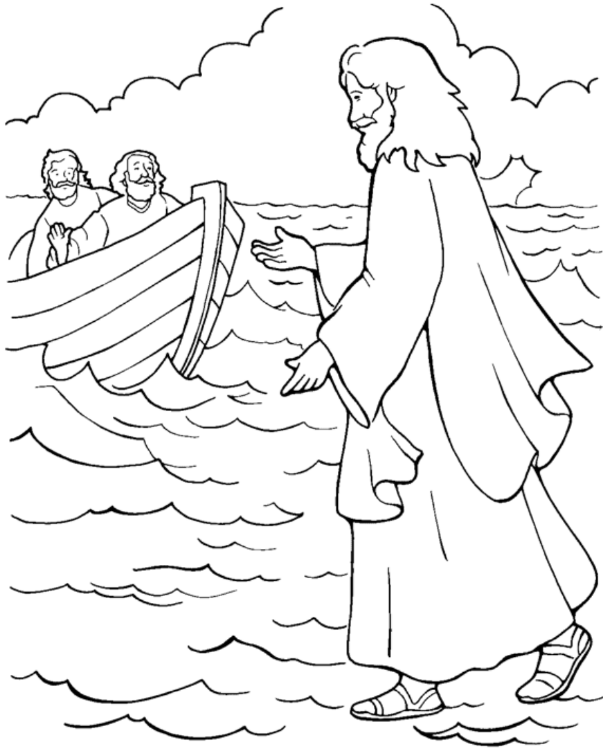
Jesus Walks on Water

From Thru-the-Bible Coloring Pages for Ages 4-8. © 1986, 1988 Standard Publishing. Used by permission. Reproducible Coloring Books may be purchased from Standard Publishing, www.standardpub.com, 1-800-543-1301.